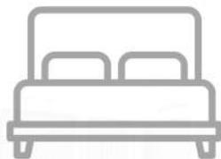
Bedroom 1 King Size Bed