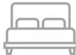
Bedroom 2 King Size Bed